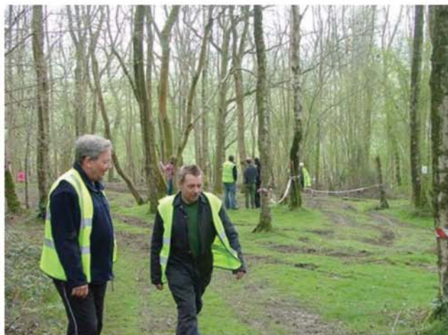
The course and walking the area