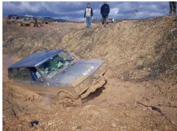
Range Rover in the Gully