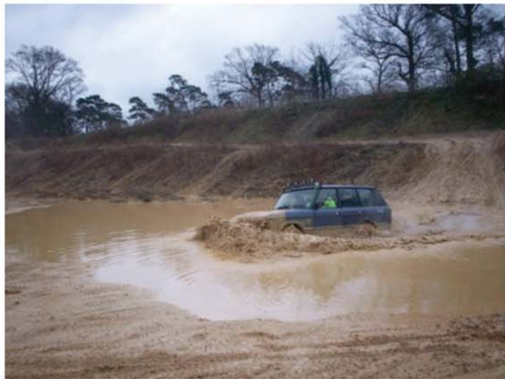
The Shallow end