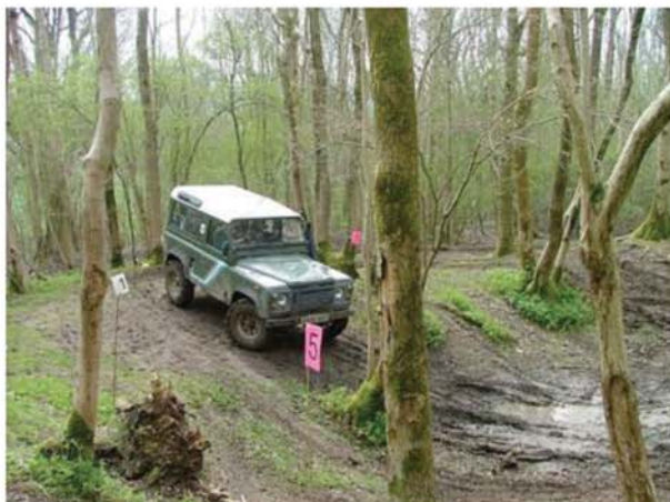
Neil heading for the trees