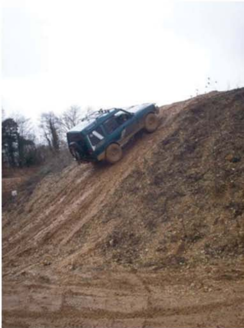
Disco on the up!!

A new site for the club and very well received! The rain in the morning meant by the afternoon sunshine the site was lovely and sticky, we will be back there later this year!