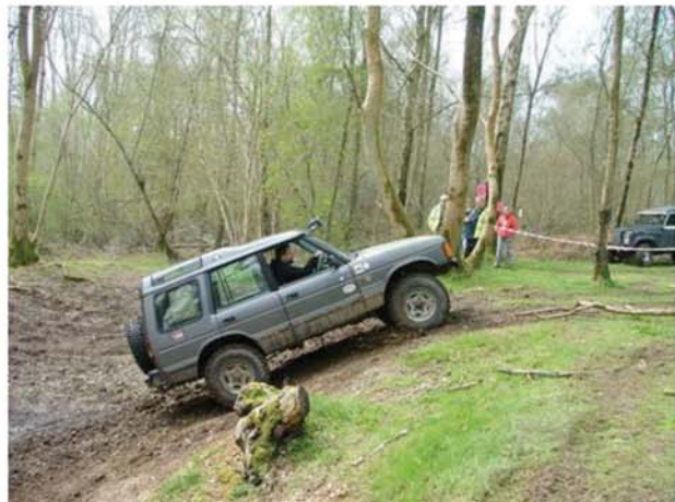
Disco on the way to a clear round