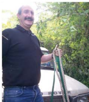
Am I having Fun Yet???