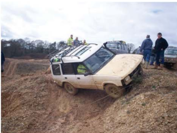
Nicely parked and ready to roll