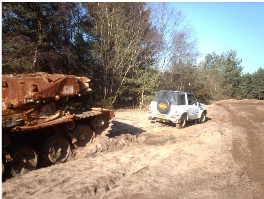
Tonka tows a tank!!!