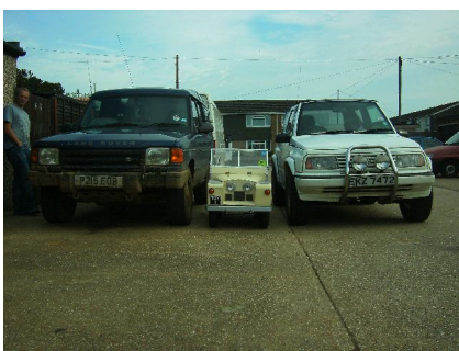
Size doesn't matter in our club